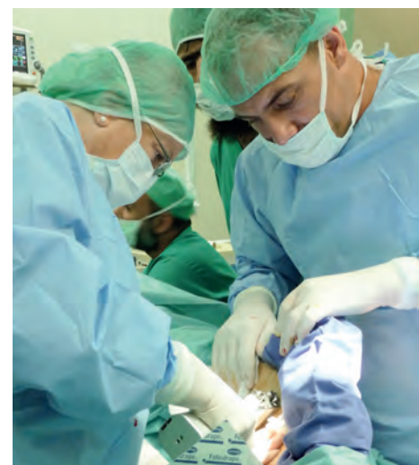
Gaza: Surgery at Nasser Hospital in Khan Yunis

*The blockade on Gaza means there are fuel shortages and daily power cuts. As a result, people try to make do with generators, contraband gas canisters, candles, and oil lamps that can lead to serious domestic accidents.