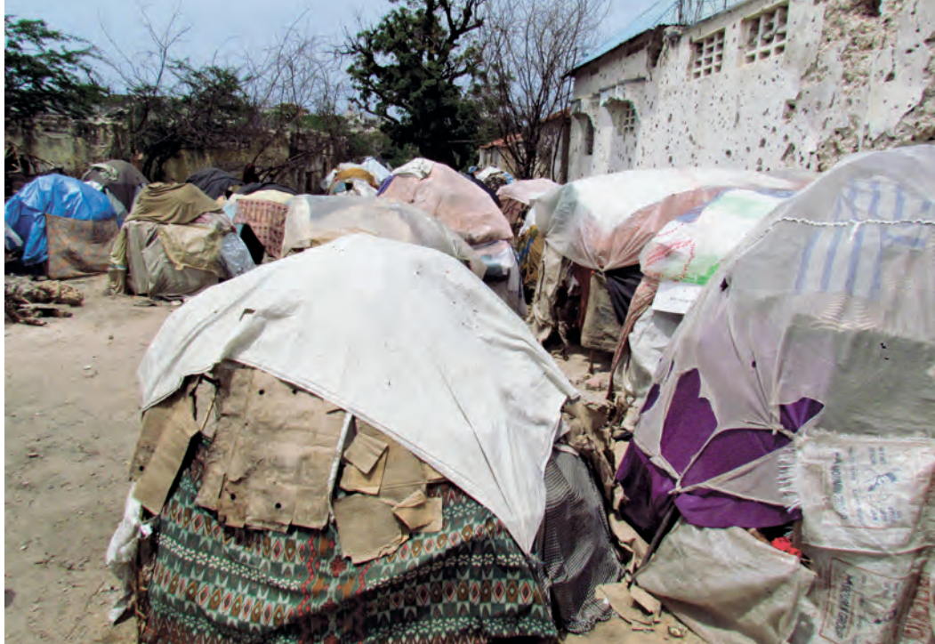
Displaced people gather in makeshift tents near the ruins in Hodan neighbourhood, one of the most destroyed parts of Mogadishu.