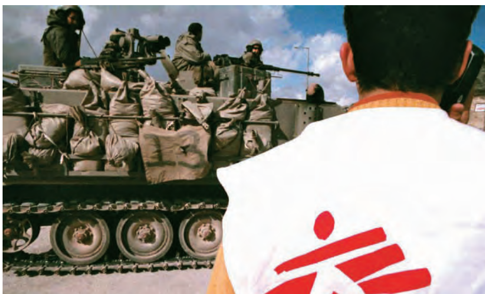
MSF speaks out about the suffering of civilians in danger in numerous conflict areas, such as the Occupied Palestinian Territory. Israeli checkpoint 2002

See a short film and an interactive timeline about MSF's 40 year history on www.msf-me.org .