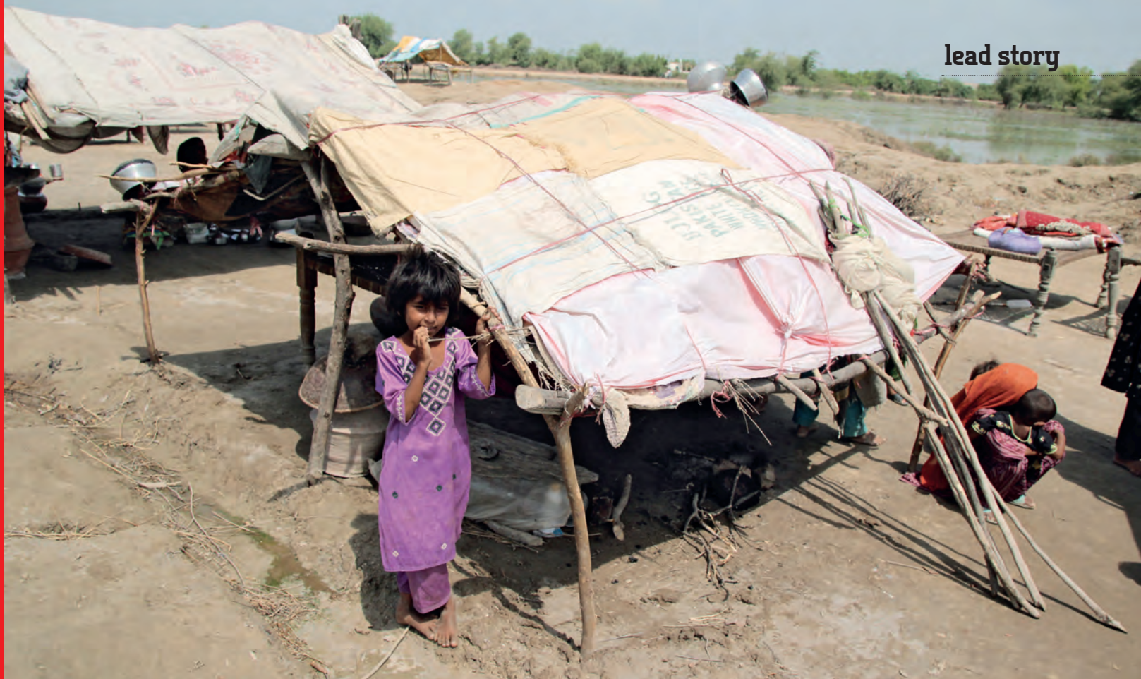
Families displaced by floods take refuge in makeshift tents on high land or elevated roadsides in Badin District, southern Sindh province.