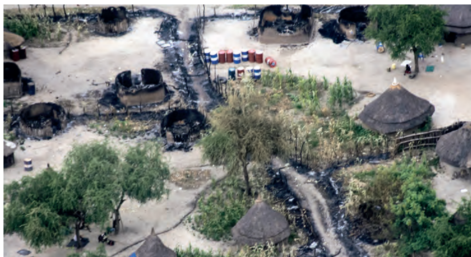
South Sudan: Part of the MSF clinic compound after it was looted and partially burned during a raid on Peiri and surrounding villages on August 18.