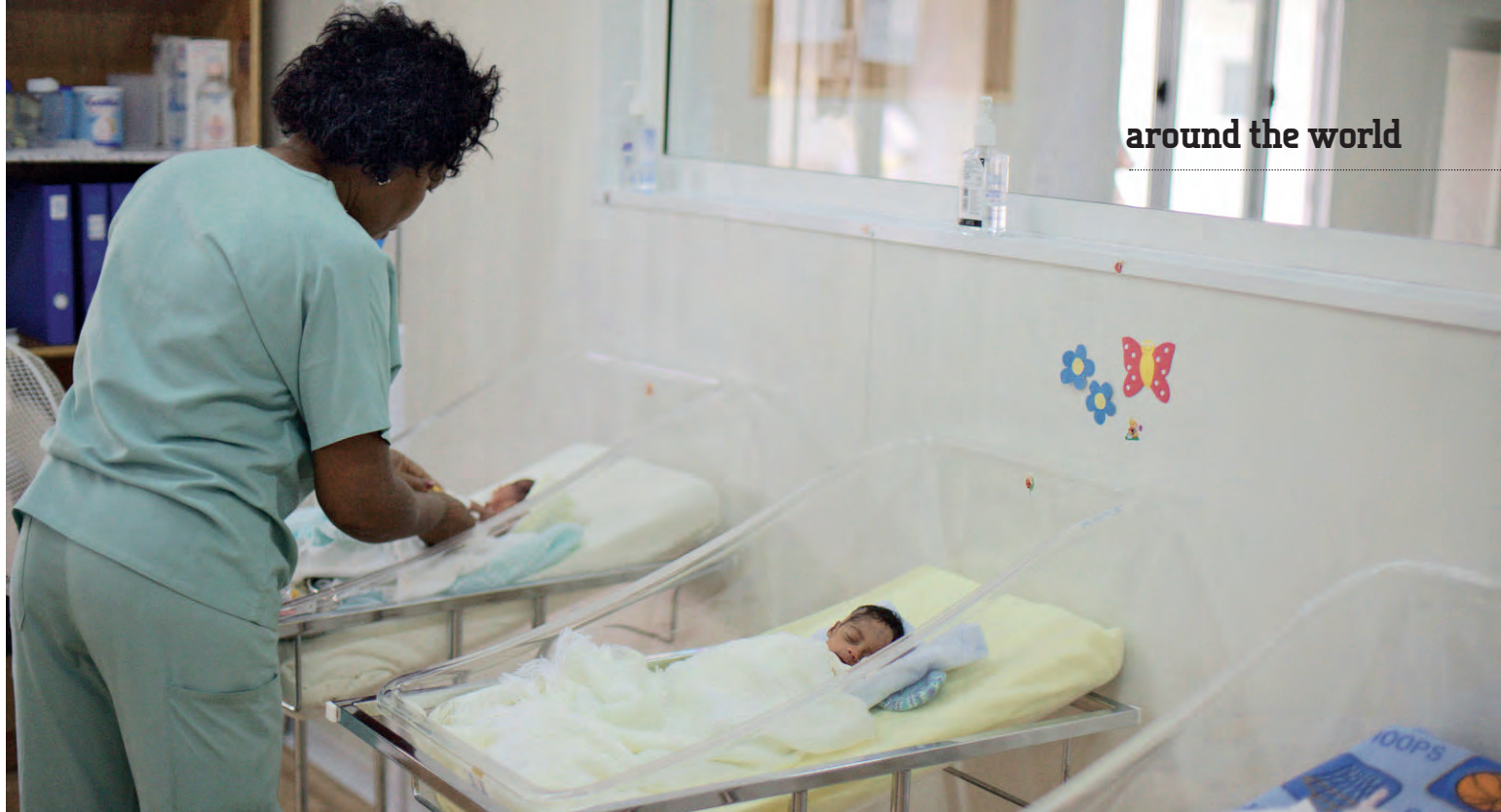
Haiti: Children delivered at MSF's newly inaugurated obstetric hospital in Port-au-Prince