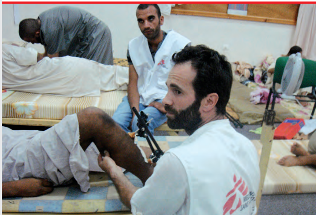
In many prisons in Misrata MSF teams have been providing medical care and psychological support to detainees, mostly soldiers who have been taken prisoner.

In Benghazi, MSF has been supporting and training a network of more than 40 Libyan psychologists. The network has been providing psychological support to patients in health facilities as well as to displaced people living in camps around the city.