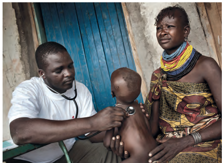
استشارة في عيادة متنقلة تابعة لمنظمة أطباء بلا حدود في قرية كوكورو.