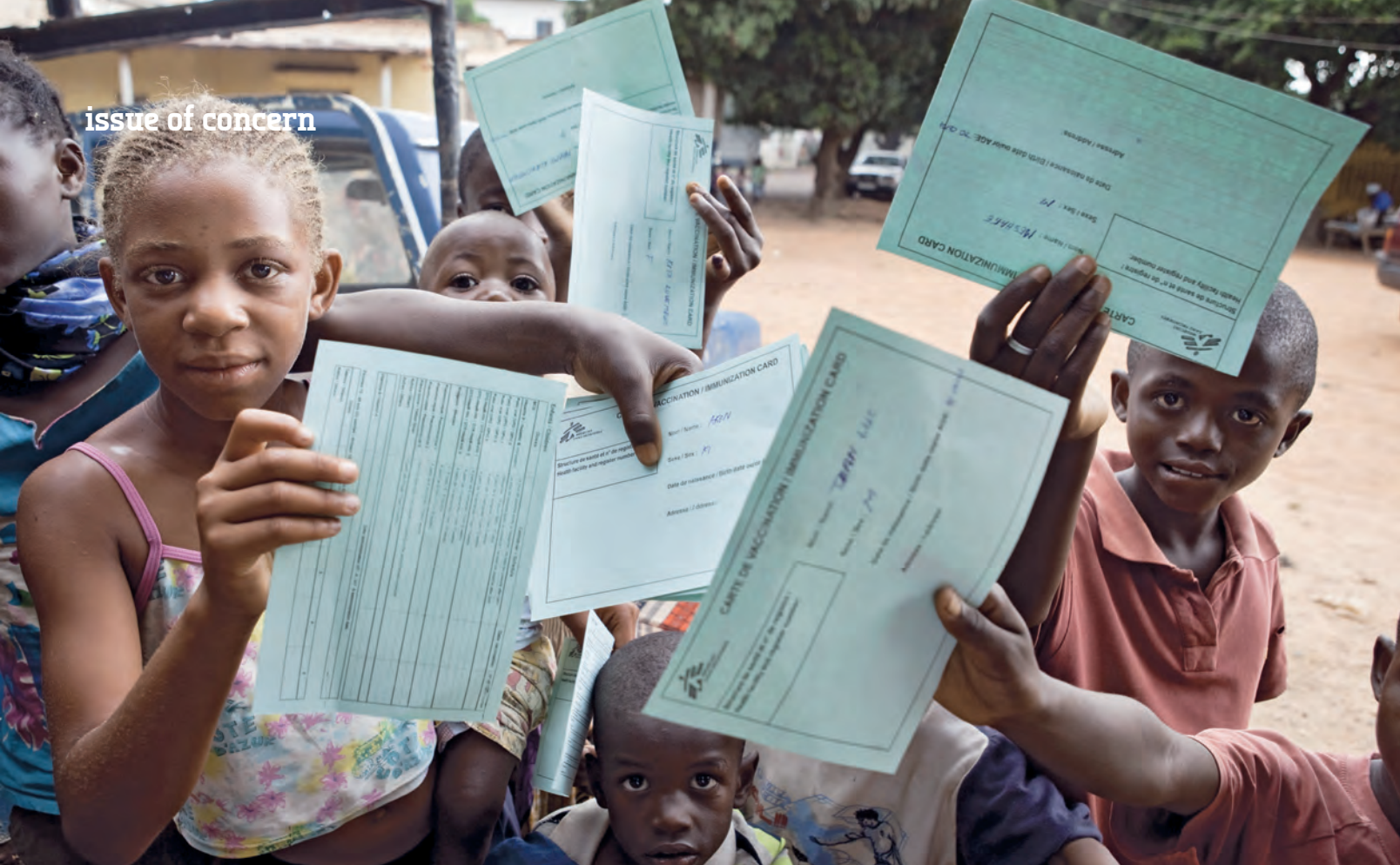
Children show their vaccination cards at a health centre in the Democratic Republic of Congo.