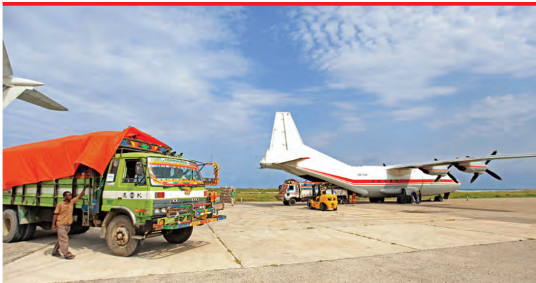
Medical and logistical goods for treating malnutrition, cholera and measles are offloaded at Mogadishu's airport.