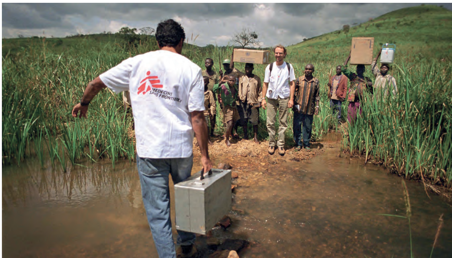
Maintaining independence is crucial for carrying out humanitarian work worldwide, especially in conflict-ridden countries like the Democratic Republic of Congo.