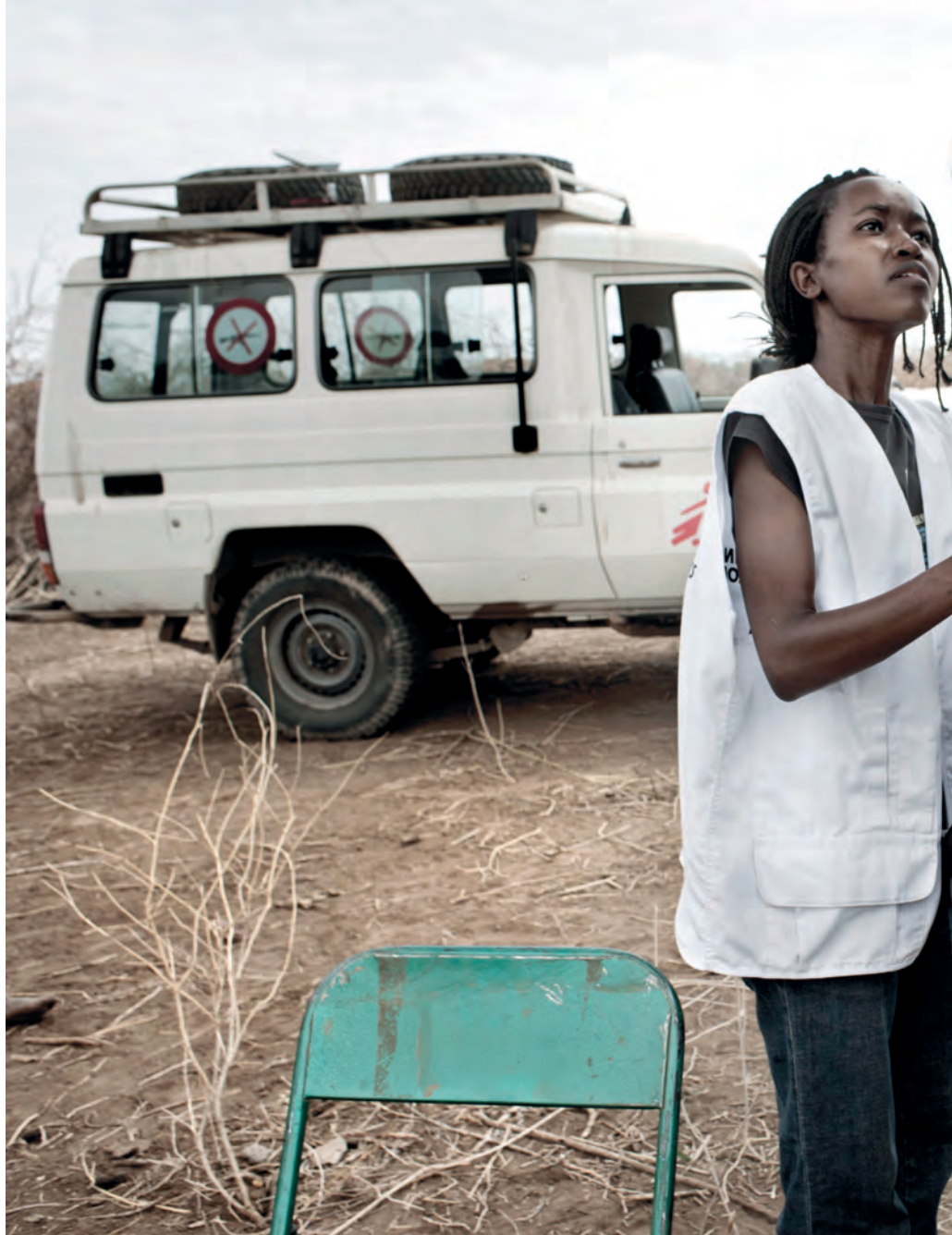
An MSF nurse measures a baby's weight as part of a medical check-up during a mobile clinic visit to Nalemsokon village.

This will help MSF draw attention to the crisis of childhood malnutrition that affects 195 million children around the world.