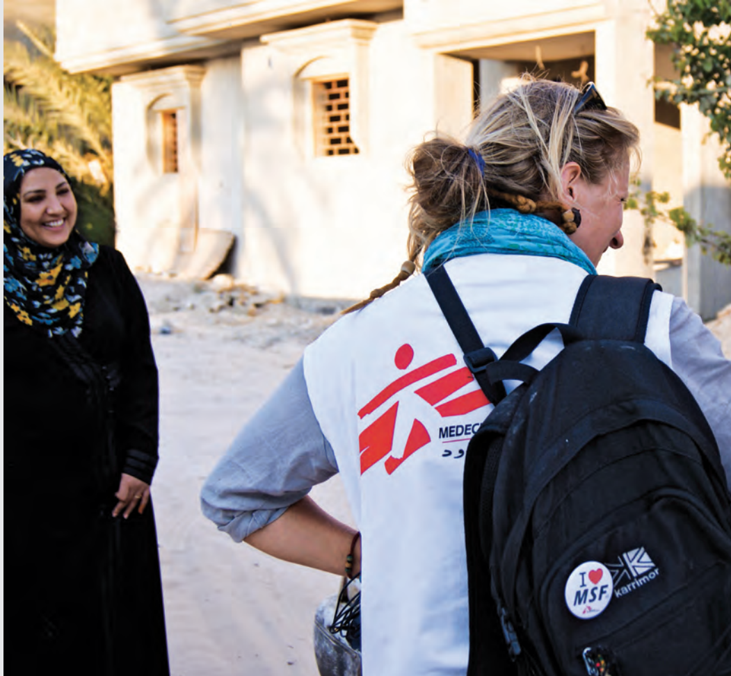
Following months of fierce conflict, parents and medical staff are concerned for the mental well-being of the children of Misrata.

Members of the network have been provided with guidance in recognizing trauma-related mental health symptoms and establishing clear referral criteria.