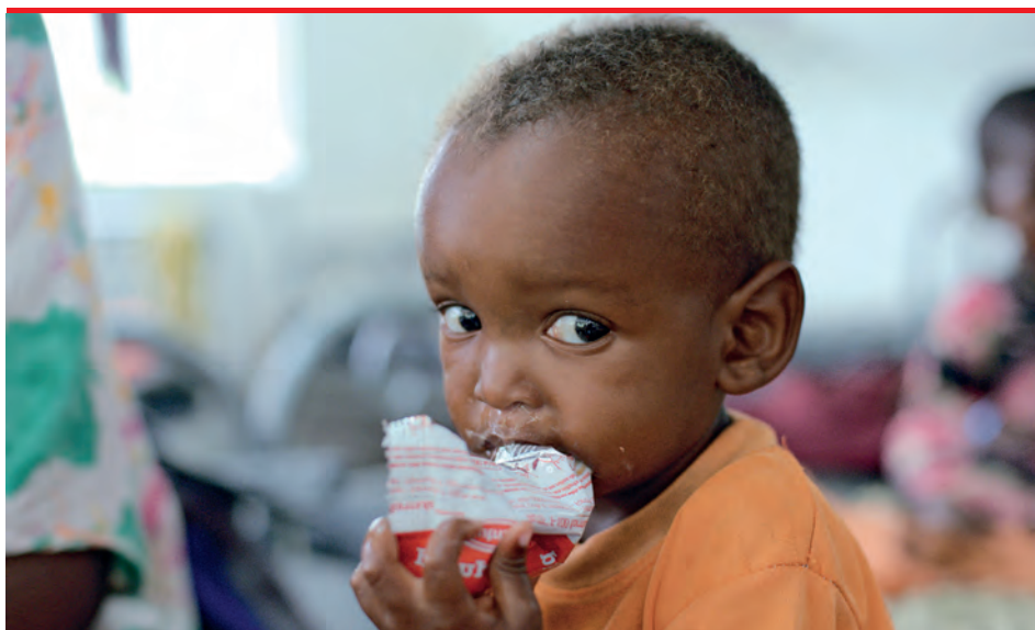
MSF developed an outpatient medical protocol using ready-to-use therapeutic food that has become the worldwide standard of care for treating children with severe acute malnutrition. Somalia 2011