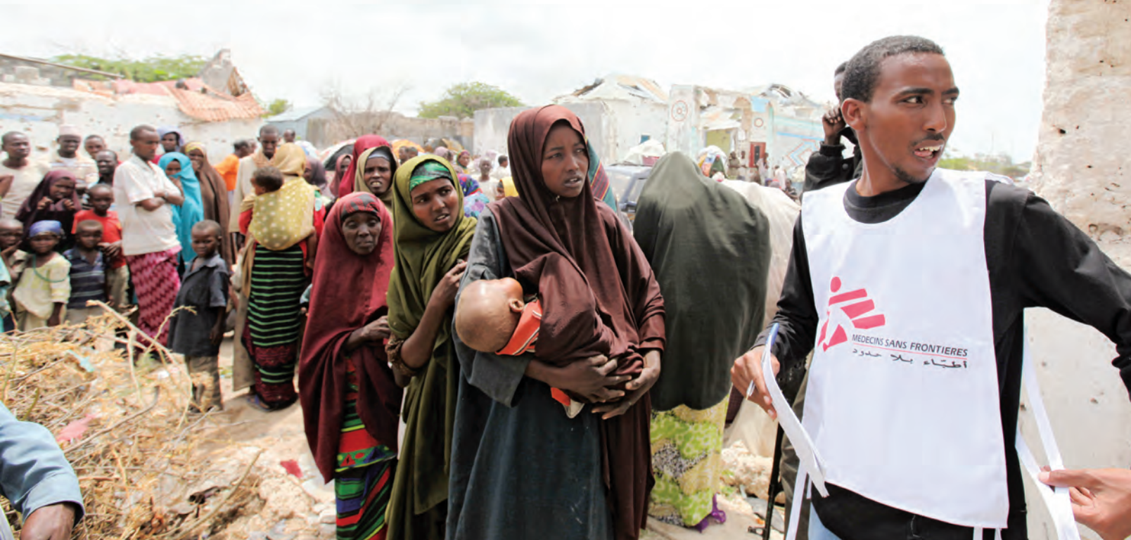
MSF staff helping some of the Somali people who have fled their homes south of Mogadishu.