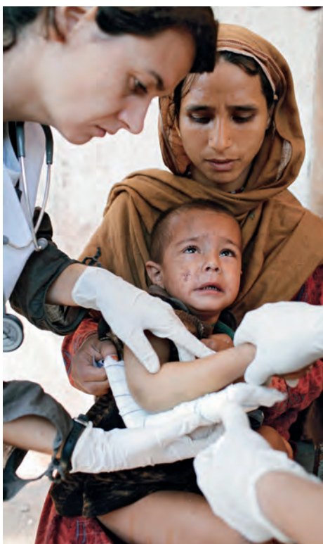
In Pakistan MSF's financial independence means MSF has been able to provide assistance in regions where other international organizations were banned. Pakistan 2005

countries like Afghanistan, Armenia, Chechnya, Colombia, Dagestan, Georgia, Ingushetia, Iran, Iraq, Jordan, Occupied Palestinian Territory, Pakistan, Russian Federation, Turkmenistan and Uzbekistan.