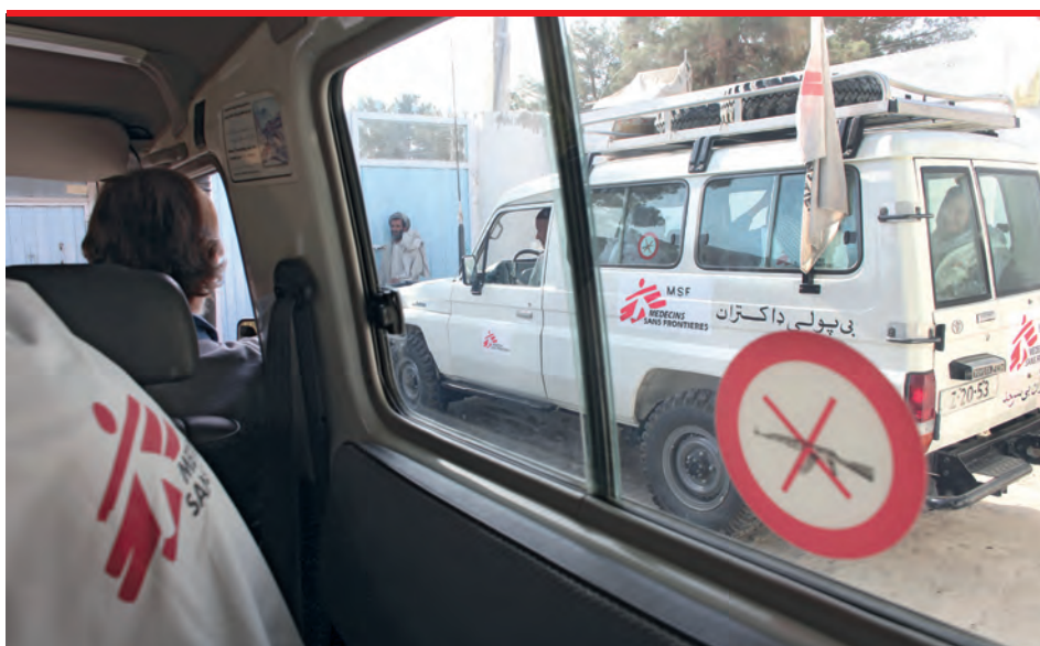
In conflict zones such as Afghanistan, MSF's complete independence, neutrality and impartiality is what negotiates our access to populations in need of emergency medical assistance. Afghanistan 2010