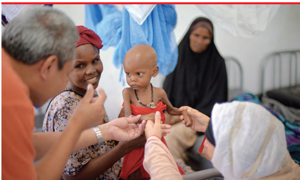
An MSF therapeutic feeding centre in Hodan District, Mogadishu, where children suffering from malnutrition with complications are provided with 24-hour care.