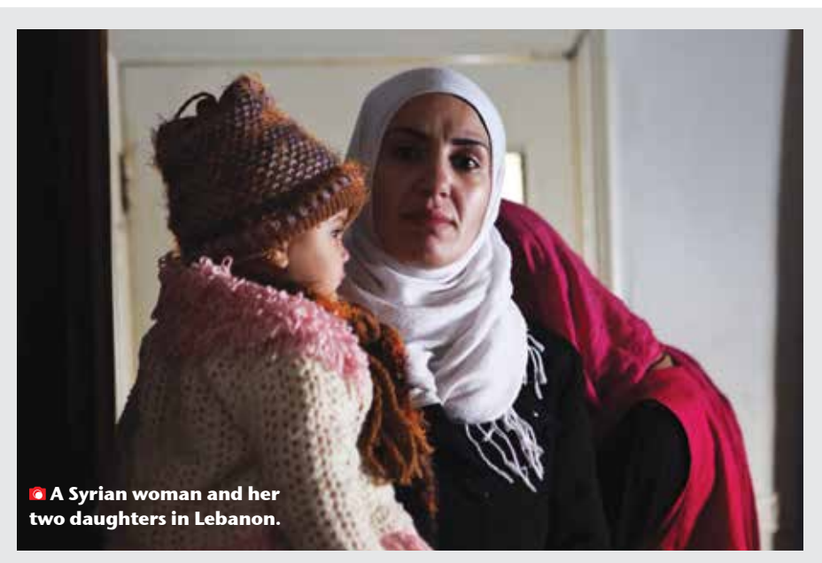
STRUGGLING TO SURVIVE

"We fled the war in Syria and now we live in a miserable cold garage. My 15-year-old daughter suffers from anorexia and still has serious nightmares from the bombings in our village. My husband lost his hearing and without support and international aid,